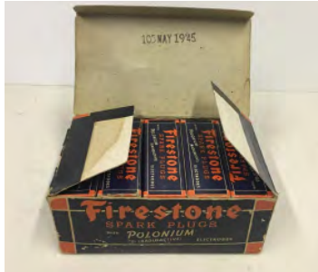
1945 Firestone Spark Plugs, NOS Polonium, M-80

Imagine selling RADIOACTIVE spark plugs today, what were they thinking?