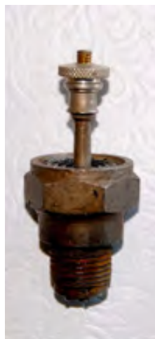
Anderson Glass Insulator, 18mm, Motorcycle Spark Plug, Indian