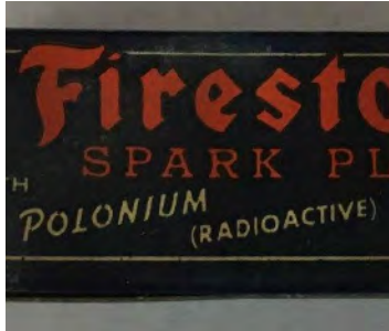
Firestone Spark Plug, Polonium Box

Imagine selling RADIOACTIVE spark plugs today, what were they thinking?