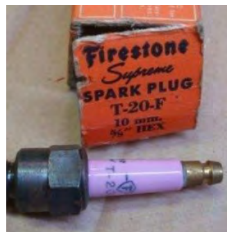
Firestone Spark Plug, Supreme Pink Polonium T-20-F, 10mm, 5/8 inch Hex