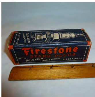
Firestone Spark Plug, M-100, Polonium Radioactive Electrodes