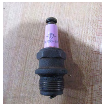
Firestone Spark Plug, Pink Polonium