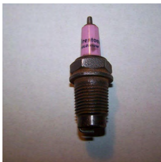
Firestone Spark Plug, Pink Polonium