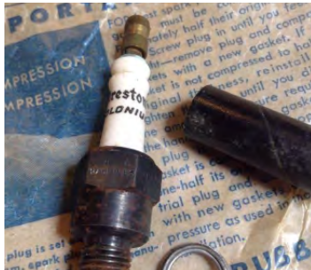
1940-43 Firestone Spark Plug, Unused T-40, Radioactive