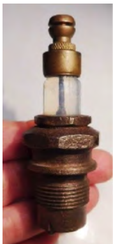
1930s BEACON - LITE Spark Plug, Made By the Central Petroleum Company of Cleveland Ohio